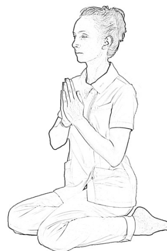
Figure 3: Mermaid Position

It is very usual that some of the new practitioners might feel uncomfortable kneeling or sitting in the illustrated postures; however, it is also common to change posture during a chant. For example, people who weigh more than average would not be able to sit on their raised heels throughout the session; therefore, they would be advised to sit flat on the uppers of their feet or to sit in a mermaid position. Moreover, it is also common to switch legs from side to side while sitting in a mermaid position once discomfort is felt. When changing position, please be aware not to point your toes toward the Buddha's images as pointing toes is considered to be rude or insulting posture in many of the Asian's cultures. The recommended technique when